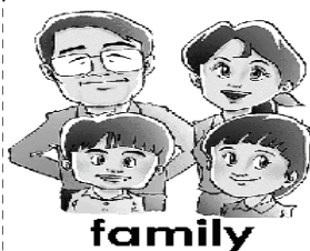
PHOTO DIRECTORIES! The St. Michael's Photo Directories have arrived! If you had your picture taken for the Directory, your copy is available to be picked up at the office.

SK: Children must be 5 years of age by December 31/16